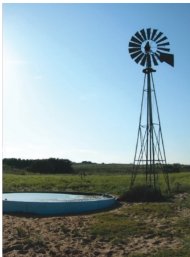
Windmills are often used in the western U.S. to provide a water source for many wildlife species.