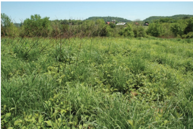
Native grasses and forbs may be planted where sufficient and desirable native grass/forb cover is lacking.

Plant Native Grasses and Forbs should not necessarily be recommended where additional early successional vegetation is needed. For example, in large forested areas where additional early successional plant communities might be required to provide habitat for some wildlife species, such as loggerhead shrike, northern bobwhite, or eastern cottontail, it is likely that desirable native grasses, forbs, brambles, and other plants will establish from