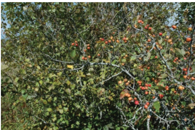
Shrub plantings, such as this hawthorn, provide nesting cover, escape cover, and an important source of soft mast.

Shrubs may be planted to create riparian buffers along streams and ponds. Vegetated buffers are important to maintain stream bank stability as the roots of the vegetation along the stream help hold the soil in place along the stream. Additionally, the aboveground vegetation in buffers filters sediment from water moving into the stream or pond after rainfall events. Riparian buffers also may provide cover and travel corridors for various wildlife species. Finally, buffers of vegetation, especially trees and shrubs, provide shade to keep stream water temperatures during summer lower, which may benefit cold-water fish species. The minimum recommended width for riparian buffers is 100 feet, but width may vary with size and order of a stream, as well as topography and landowner objectives.