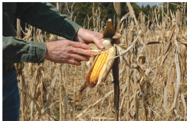
Warm-season grain plots, such as this corn, can provide an important source of energy through winter for many wildlife species.