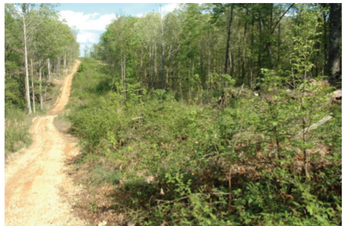
This forest road was daylighted to provide additional browse, soft mast, and nesting cover for various wildlife species. The road was graveled to prevent erosion because it receives considerable traffic from land managers.