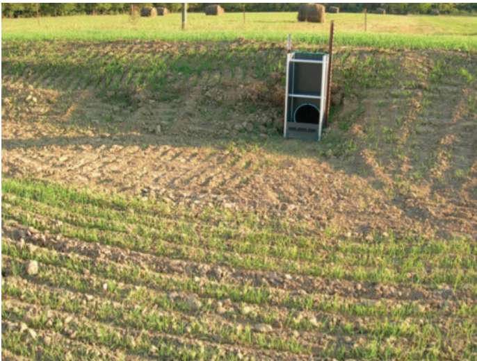
Water control structures allow manipulation of the water level in ponds and areas flooded for wildlife using a dike or levee.