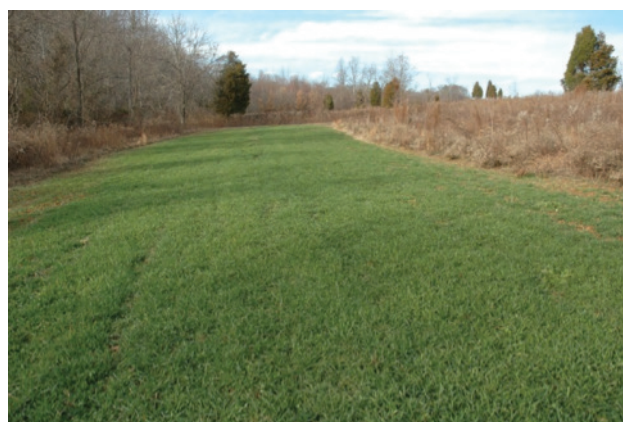
Cool-season food plots provide nutritious forage fall through spring when availability of naturally occurring forages may be relatively low. Depending on what is planted, such as this winter wheat, a nutritious seed source also is available the following late spring through summer.