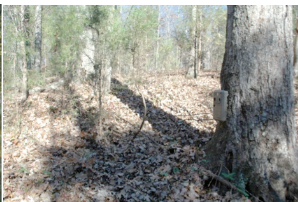
Infrared-triggered cameras are a great tool to survey populations of several wildlife species.