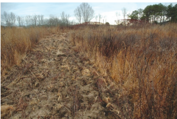
Disking sets back succession, facilitates decomposition, provides bare ground, and stimulates the seedbank, encouraging early successional species.