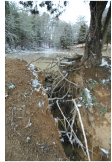
Tree roots can cause dams to fracture, leak, and eventually break.