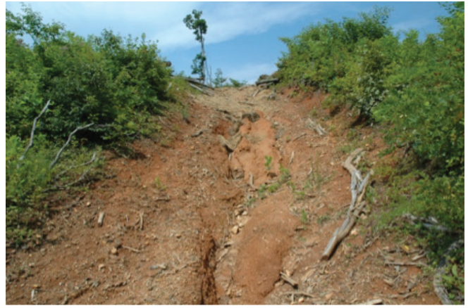
Forest roads should not be constructed perpendicular to slope. Roads such as this should be closed and planted to trees or shrubs.

Vegetation, whether naturally occurring or planted, on forest roads cannot stand very much vehicular traffic. Thus, those roads that receive considerable traffic from land managers may require gravel. Forest roads should be gated where they intersect public roads to prevent trespassing and poaching (killing wildlife illegally).