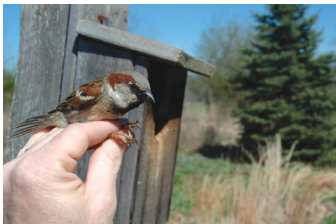
House sparrows often displace bluebirds from nest boxes constructed for bluebirds. This invasive nonnative species should be removed whenever possible.

should be recommended. If the problem is related to a nongame animal, or if regulated hunting or trapping is not allowed on the property, or if control is necessary outside the regulated hunting and trapping seasons, or if the problem is related to one or a few individual animals (whether game or nongame), then Wildlife Damage Management Techniques would be the appropriate practice to recommend. For example, if cottontails were causing problems in a garden, control would be necessary outside the regulated hunting or trapping season (fall and winter). Thus, Wildlife Damage Management Techniques could be recommended during spring or summer when the problem is occurring. Wildlife Damage Management Techniques should be used to control nongame and nonnative species for which there is no hunting or trapping season, such as woodpeckers damaging a building or house sparrows outcompeting bluebirds.