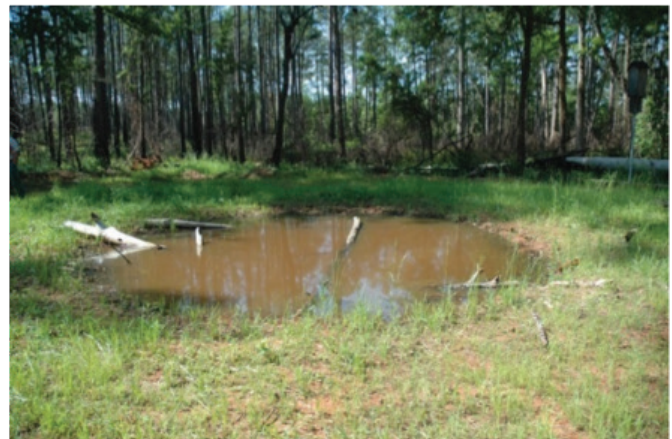
Small ponds can be created where water is relatively scarce to provide water and habitat for several wildlife species.

NOTE: these ponds are designed for various wildlife species, not fish.