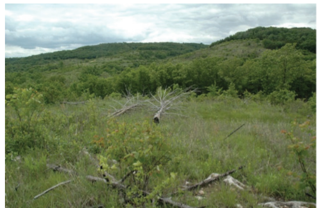
Chainsawing can be used to increase early successional vegetation in wooded areas. On this property, trees were cut, not harvested, and the site has been burned every 2 years to maintain an early succession. Nothing was planted. A forest was converted to an early successional plant community.

Forest Management should be recommended to manage and maintain a forest, either through Forest Regeneration or Forest Stand Improvement practices. Indeed, herbaceous cover (such as native grasses and forbs) is stimulated when trees are cut and seed from the seedbank germinates. However, the herbaceous community is short-lived and woody species quickly dominate the site (especially on hardwood-dominated sites) unless tree removal is followed with additional treatment. Root-plowing following removal of hardwood