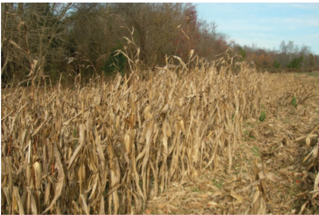
By leaving strips or blocks of grain unharvested, additional food is available for wildlife. Leaving this food resource can be an important consideration, especially in areas where winters are harsh.