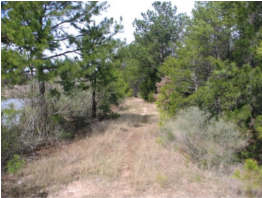
This fish pond dam likely will have problems with leakage (if not already) and breakage if the trees are not killed or removed.

Low water levels can cause significant problems in ponds and impounded wetlands. Improperly constructed or damaged spillways can lead to excessive dam or levee erosion and excessive aquatic vegetation along fish pond margins. The spillway should be repaired if it is eroding or otherwise damaged, keeping the pond or impounded wetland level too low and increasing the chance of the dam eroding during heavy rains. In special cases, leaks around the spillway or levee structure can be stopped with the addition of special clays or plastic liners.