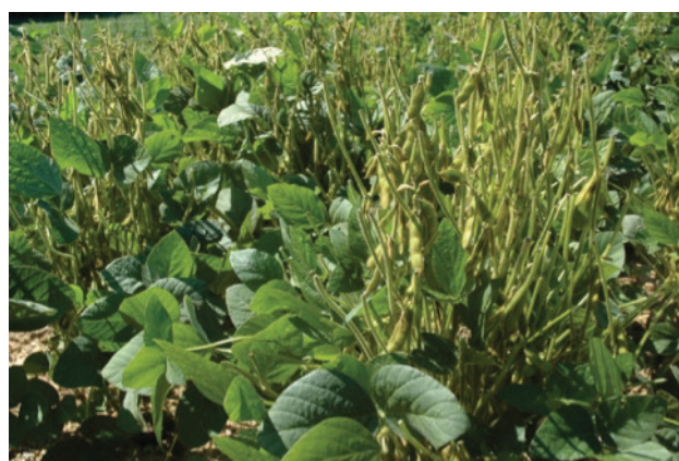
Warm-season forage plots, such as these soybeans, can provide an excellent source of protein (leaves) during summer and an energy source (beans) in winter.