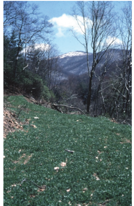
Forest roads, such as this one planted to clovers, provide nutritious forage as well as travel corridors for various wildlife species.