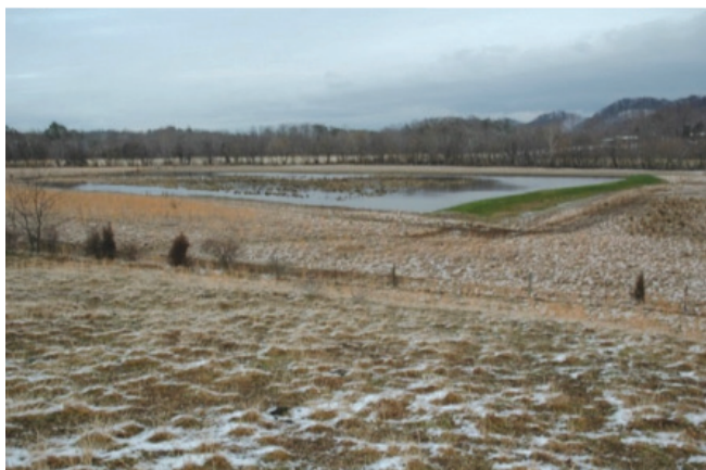
Shallow impoundments can provide excellent habitat for migrating and wintering waterfowl and other wildlife species.

NOTE: Water Developments for Wildlife can be recommended when an additional water source is needed or when an existing water development for wildlife is essentially not functioning to hold water or to provide water for a focal species because it is in serious need of repair.